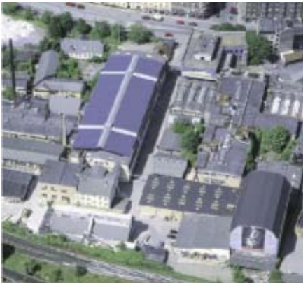
Design Study Valby Skole