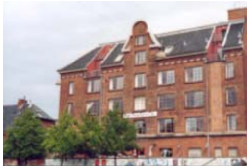
Valby Communal building